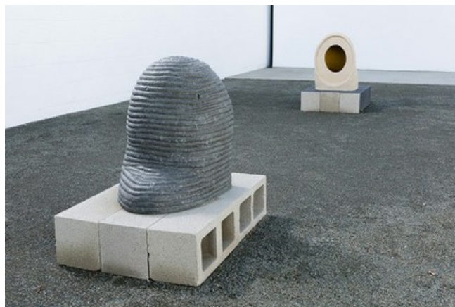
Anna Sew Hoy, "Gravitational Pull," 2015 Stoneware and enamel, each 22.5 x 16 x 19" Various Small Fires (VSF)

Quoting from visual history is a defining aspect of post-modernity, and exceedingly common, but it is refreshing to see an artist pull it off with such an ambitious set of references, major and minor, figurative and abstract. In the center of the gallery, a washed-out canvas is piled in a heap, with the replica of a purple bird standing on top and the model of a yellow hand emerging from the folds. Titled "Mondays," (2015) it summarizes the struggle of a working artist to find meaning in new ways. The show only falters when Kantarovsky loses confidence and indulges too fully in his inclination to comedy.