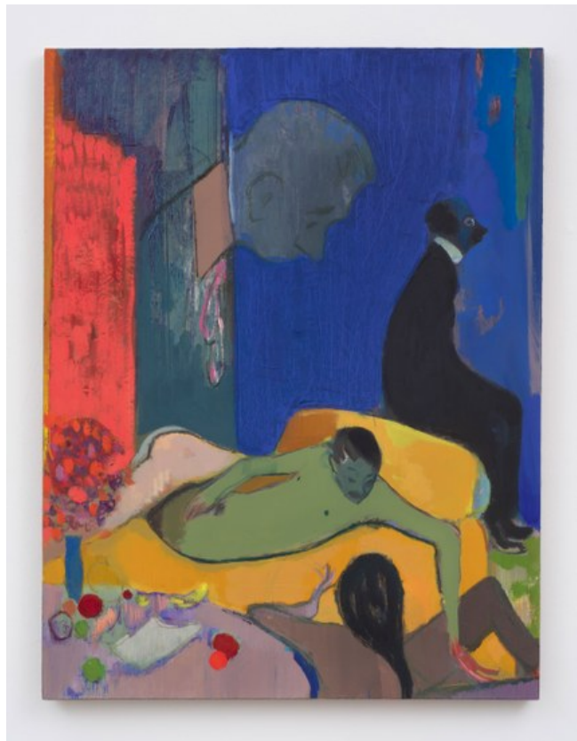
Sanya Kantarovsky, "Apples and Oranges," 2015 Oil, pastel, watercolor, and oil stick on linen 33-1/2 x 25 x 1-7/8 inches (85.1 x 63.5 x 4.8 cm) Courtesy the artist and MARC FOXX, Los Angeles Photo: Robert Wedemeyer, 2015

A few months ago at LAXART, Sanya Kantarovsky exhibited a video that revealed a hopeful outlook rarely found these days: Happy Soul's rubbery-limbed, wide-eyed fellow was naked but hid his nether regions with his hand, eventually was covered by falling leaves that transformed into colorful butterflies and dispersed, all set to pop music. It bordered on being too sweet but it was also memorable. Now the same artist, born in Riga, living in New York, shows his latest paintings at Marc Foxx Gallery through February 7, a show called "Gushers," referring to a sort of candy.