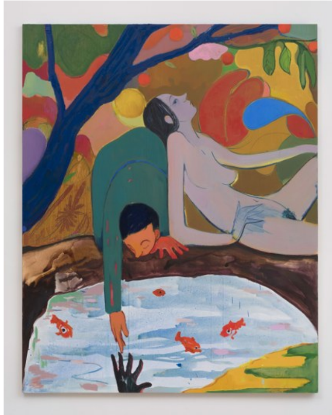
Sanya Kantarovsky, "Wet Hands," 2015 Oil, pastel, watercolor, and oil stick on canvas 75 x 55 x 1-1/8 inches (190.5 x 139.7 x .9525 cm)

Using a rich Fauvist palette, combining oil, pastel, watercolor and oil stick on canvas, Kantarovsky's compositions are complex and confounding. Against a layered background of stylized trees and plants, "Wet Hands" (2015) features a Modigliani-esque female nude resting against the crouched figure of a man reaching down into a Matissean pool of pale blue water where goldfish are swimming. A dark hand reaches up out of the water, perhaps a symbol of the unconscious, of the painter's wet hands. The point is to retain such mystery, hint at narration without resolution. In "Apples and Oranges" (2015) a naked man reclines while looking at a dark-skinned woman on the floor while a man in a suit sits on the edge of the chaise and stares away from the scene. A ghostly enlarged profile of a mournful man looks over the scene. The warm blue background, bright orange and ochre shapes, figures in olive and brown with elongated limbs, recall Gauguin and other early modern artists. Perhaps the profile is the artist himself looking longingly at the past.