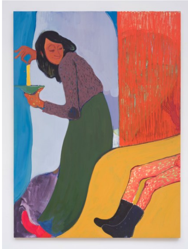
Sanya Kantarovsky, "Sleazeballs," 2015 Oil, pastel, watercolor, and oil stick on canvas 75 x 60 x 1-1/8 inches (190.5 x 152.4 x 3.4925 cm)

Quoting from visual history is a defining aspect of post-modernity, and exceedingly common, but it is refreshing to see an artist pull it off with such an ambitious set of references, major and minor, figurative and abstract. In the center of the gallery, a washed-out canvas is piled in a heap, with the replica of a purple bird standing on top and the model of a yellow hand emerging from the folds. Titled "Mondays," (2015) it summarizes the struggle of a working artist to find meaning in new ways. The show only falters when Kantarovsky loses confidence and indulges too fully in his inclination to comedy.