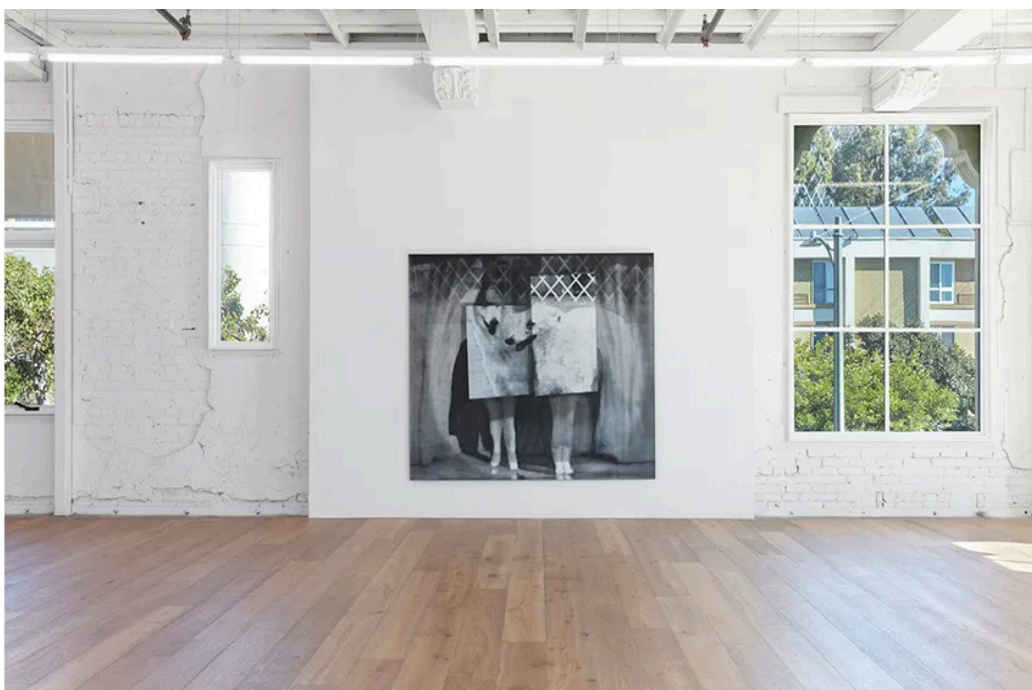
Kate Mosher Hall, While Moving Between Worlds (installation view) (2021). Acrylic and charcoal on canvas, 72 x 80 inches. Image courtesy of the artist and Hannah Hoffman, Los Angeles. Photo: Paul Salveson.