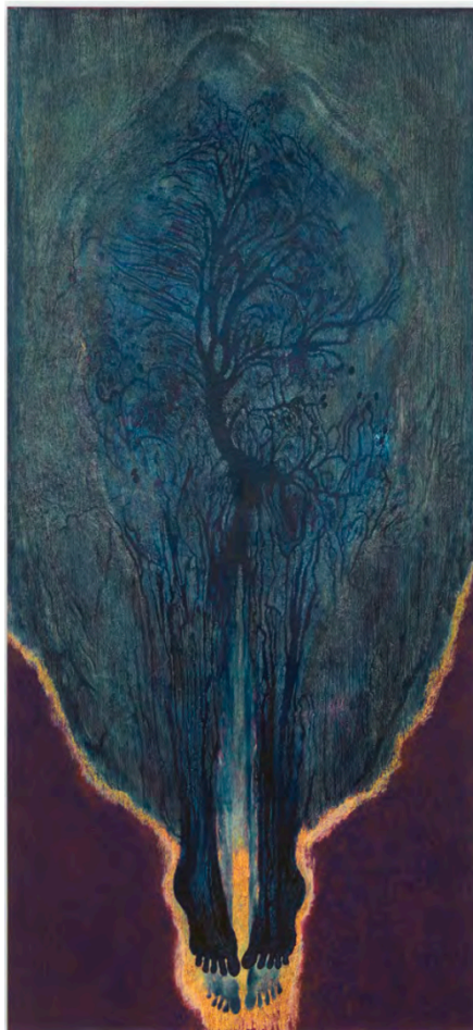
Luisa Rabbia, Ecstasy , 2019, colored pencil, pastel, acrylic and oil on canvas, 102 x 47 inches (260 x 119 cm)

artworks that explored or meditated upon, per Kandinsky, this “color of the heavens,” such as Odilon Redon’s numinous drawing of a woman’s head in profile, La cellule d’or (The Golden Cell), 1892, or Ad Reinhardt’s sublimely nonobjective blue paintings. Rabbia’s radiant Whole , 2019, features an armless, legless ur-human, perhaps freshly birthed from the primeval abyss, who levitates before a variegated backdrop of blood red. The being’s torso seems more shadow than flesh; it is painted in a shade of ultramarine that verges on jet. The subject is a fathomless window, godlike in its way—similar to the figure in Mitos , 2018, a celestial creature split in two who appears to be made from an endless number of particles. One cannot tell if this beryl-hued life-form is falling apart or coming together. It is a thing of infinite flux, mysterious and ancient—like the cosmos itself.