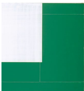
开放/投降 2009 布面丙烯 91.5 x 198 cm