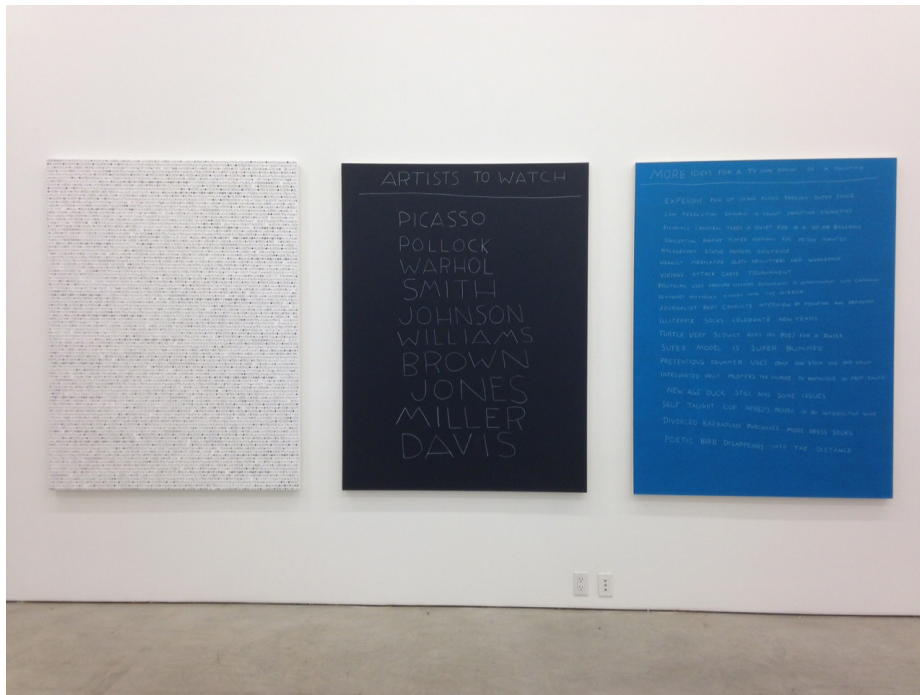
It Gets Beta (Installation View)