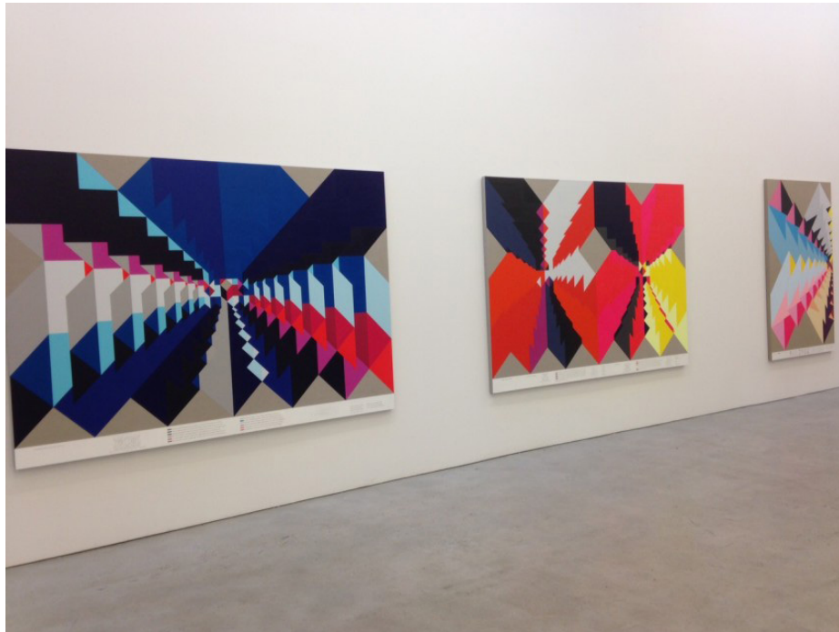
It Gets Beta (Installation View)

personal, as works such as More Ideas for a TV Show , Artists to Watch or Book Titles (Fiction and Non-Fiction) seem to reflect different pages of a diary or a notebook, presumably the artist's, where he accumulates his thoughts on random subjects with an arbitrary handwriting.