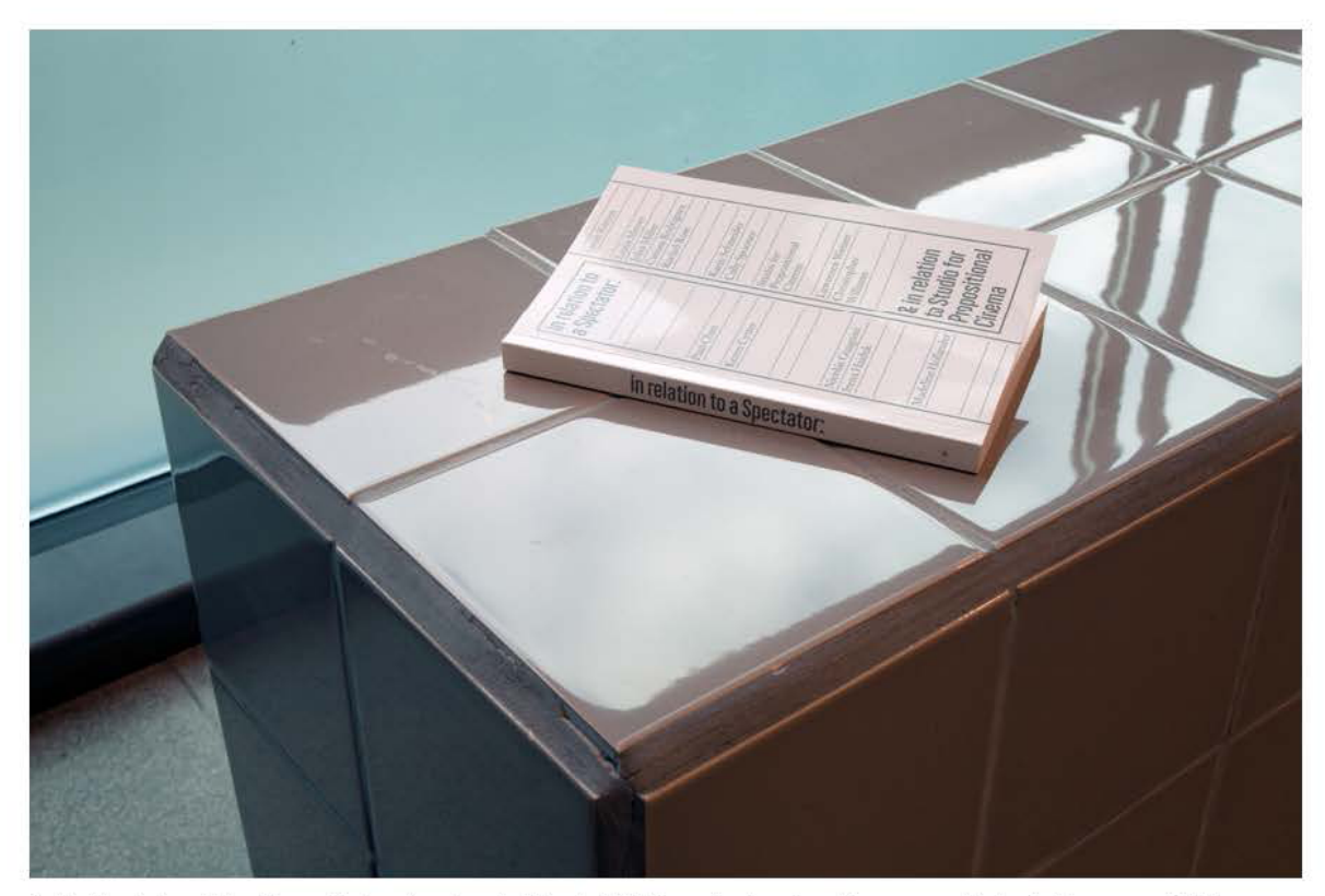
Calla Henkel and Max Pitegoff, Reading Bench (Grey) , 2013, installation view, Kestnergesellschaft, Hannover, 2017.

Four archetypal exhibition structures – stage, table, wall, book – form the basic infrastructure of the show, which gathers together works from 31 artists and artist groups who are connected with either SPC or Kestnergesellschaft. The exhibition will continually evolve over time: only a select few pieces will remain on display for its duration, with the majority being presented for limited periods – extremely limited, in the case of the performances. This complex structure is surprisingly coherent, with the potentially sprawling concept held together by SPC's lengthy, eponymous text 'in relation to a Spectator:'. The sequence of instructional statements, assembled in the propositional style of Lawrence Weiner's Statement of Intent (1969) and presented on four large panels at the entrance to the institution, attends to the transformation of scripts into inscriptions, scenography and duration – and their various interrelations.