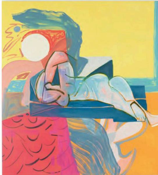
Batts Rock, 2015