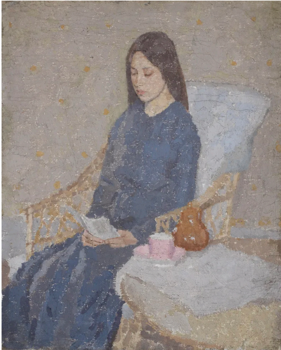
The Convalescent (c. 1923), Gwen John. Fitzwilliam Museum, Cambridge