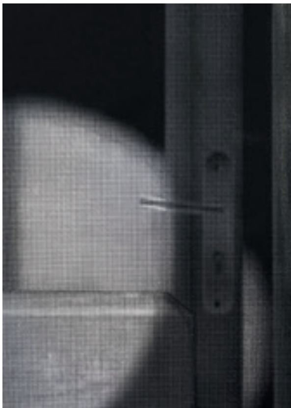
Entrance, 2021 (Detail)