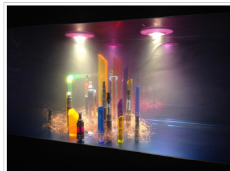
Detail of Ajay Kurian, Comfort Zone 43 (Heaven is for smokers and non-smokers) , 2014.

Also in that black room, though, is the young gun Ajay Kurian, whose sculptural confections are like nothing else out there: a black monolith glows with a deep orange planet (the checklist list notes that Gummy Bears are involved), and two wall pieces resemble alien worlds populated with, in one case, e-cigarette towers and swirling fog.