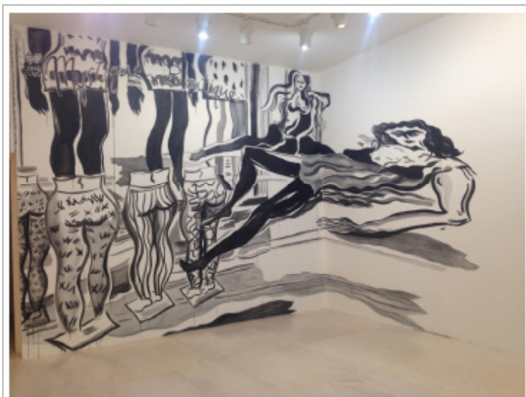
An new untitled wall drawing by Mira Dancy.

Mr. Universe's fulsome muscles rhyme very nicely with the bulging biceps and pecs in one of the six delicious paintings offered up by Gina Beavers, whose heavily textured works portray, with almost sickening amounts of paint, food porn (juicy steaks, a bounty of donuts), and porn porn (a body bedecked with bath soap). Mouths will water.