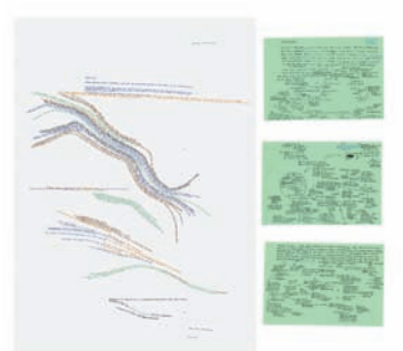
Ayreen Anastas and Rene Gabri 'Assemblage #5 (The Communist Hypothesis)*', 2010

Notes, diagrams, letters and cut outs in vitrine