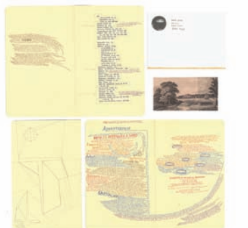
Ayreen Anastas and Rene Gabri 'Assemblage #6 (Chernyshevsky, Khrushchev, Lenin)*', 2010

Notes, diagrams, letters and cut outs in vitrine