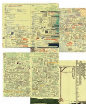
Ayreen Anastas and Rene Gabri 'Assemblage #2 (They Look Behind At Every Step and Believe It Is A Dream)' 2010

Notes, diagrams, letters and cut outs in vitrine Edition of 2 ANASTAS-GABRI-2010-0011