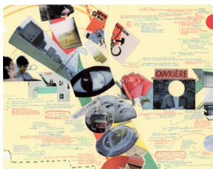
Ayreen Anastas and Rene Gabri 'One Step Forward, Two Steps Back' (detail), 2009/10

Archival C-print Print size 80 x 100 cm Frame size 85,7 x 105,5 cm Edition of 3 ANASTAS-GABRI-2010-0010