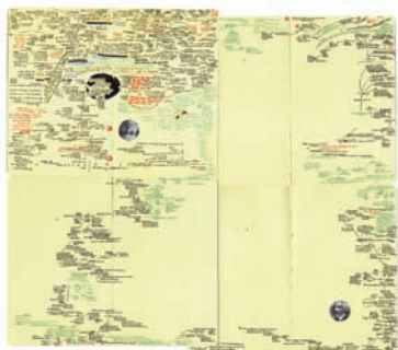
Ayreen Anastas and Rene Gabri 'Assemblage #4 (Nights of Labour)', 2010

Notes, diagrams, letters and cut outs in vitrine