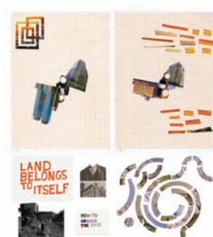
Ayreen Anastas and Rene Gabri 'Assemblage #1 (How To Unmake The Wall)*' 2010

Archival C-print Print size 80 x 100 cm Frame size 85,7 x 105,5 cm Edition of 3 ANASTAS-GABRI-2010-0010